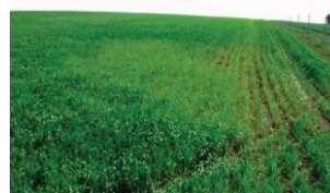
Figure 5: 'cereal cyst nematode' damage to cereals in Western Australia. This nematode has long been assumed to be Heterodera avenae , however our preliminary molecular analyses suggest all populations are likely Heterodera australis .

Manuscripts reporting our findings are in the works – so watch this space!