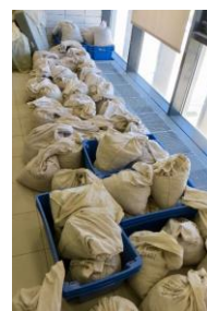
Figure 3: Soil collections from over 100 sites across multiple provinces in Turkey, made by a team of our collaborators led by Prof. Ian T. Riley (Niğde Ömer Halisdemir Üniversitesi). This collection includes many species of Heterodera .

We aim to build a collection with diagnostic utility, to tackle multiple taxonomic questions and issues of identity, expand DNA sequence coverage for the genus enhancing molecular diagnostic testing, and ultimately produce a National Diagnostic Protocol for the genus Heterodera .