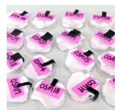
Figure 4: Cysts extracted from the soil in Figure 3 by our Turkish collaborators and subsequently transferred to the Nematology collection at the Australian National Insect Collection (CSIRO). From this collection we are generating molecular data and producing morphological specimens for the collection.